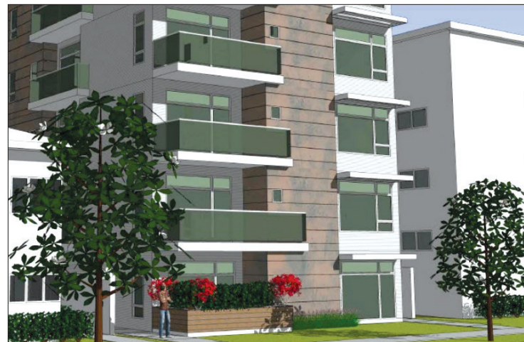
Example of Project

The Planning Commission is expected to discuss a proposed project that includes a density bonus permit for the construction of a five-story, nine-unit multi-family residential building, at the property located at 232 South Doheny