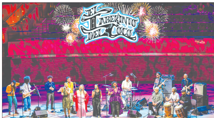
El Laberinto del Coco

"We are extremely excited about this year's Sunset Concerts season, which, in addition to exploring the diverse musical traditions and innovations from Africa and the Caribbean, also puts a spotlight on artists who strive to con-