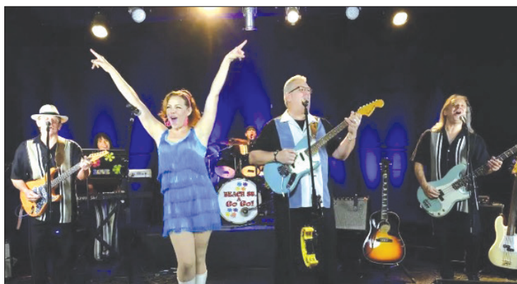
Beach St. A GoGo